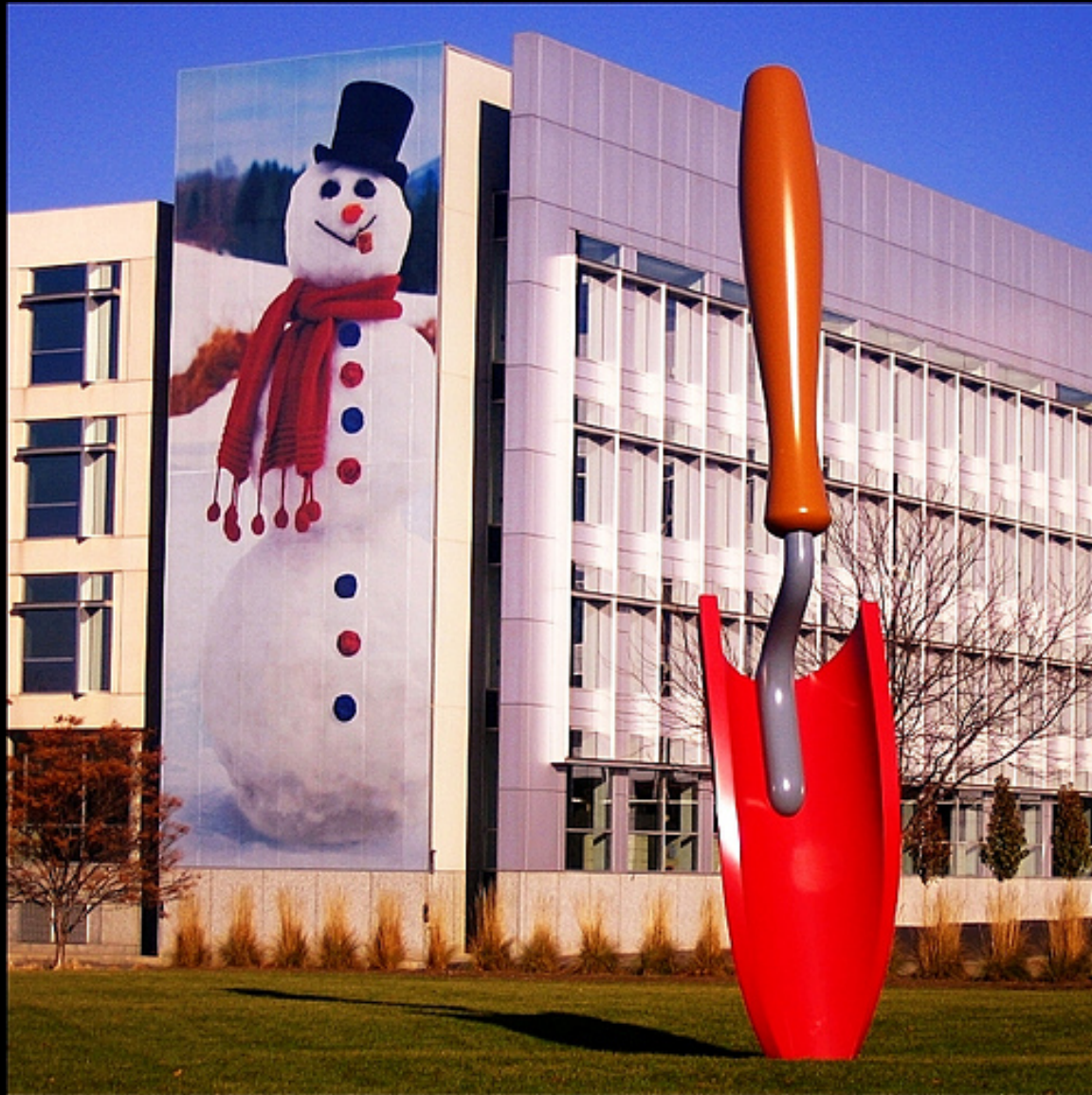
Plantior, 1716 Locust St, Des Moines, IA